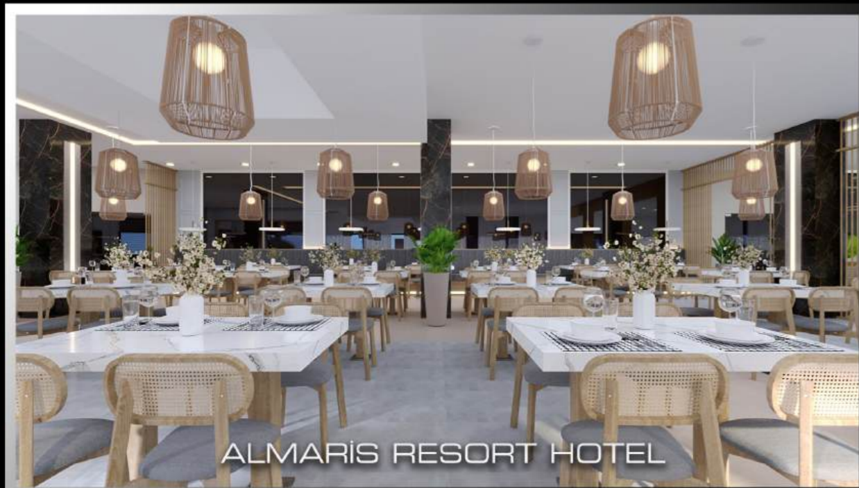
ALMARIS RESORT HOTEL